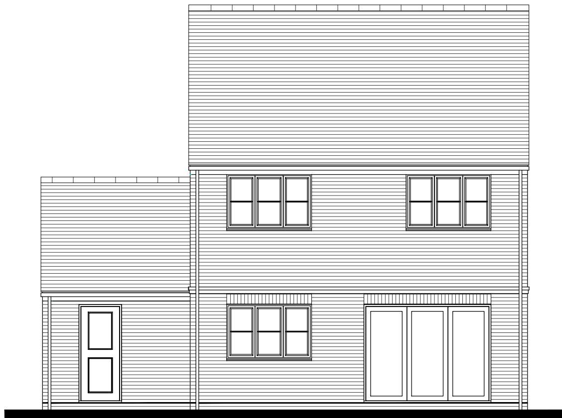
Plot 9 Rear Elevation