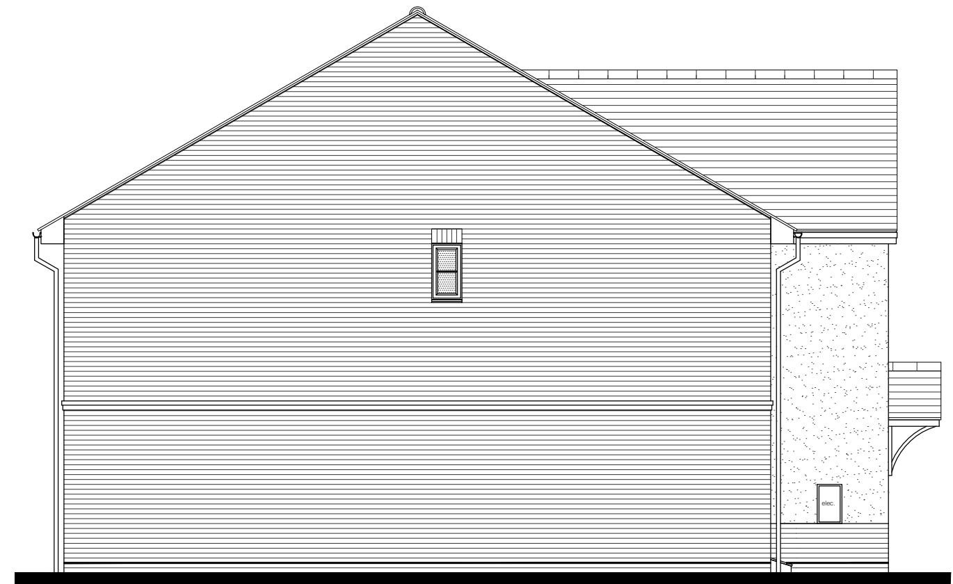
Plot 9 Side Elevation