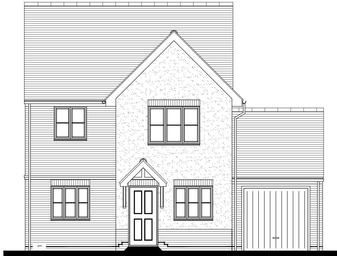
Plot 9 Front Elevation