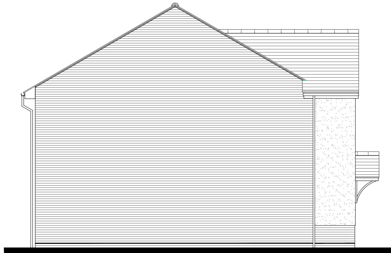
Plot 3 Side Elevation