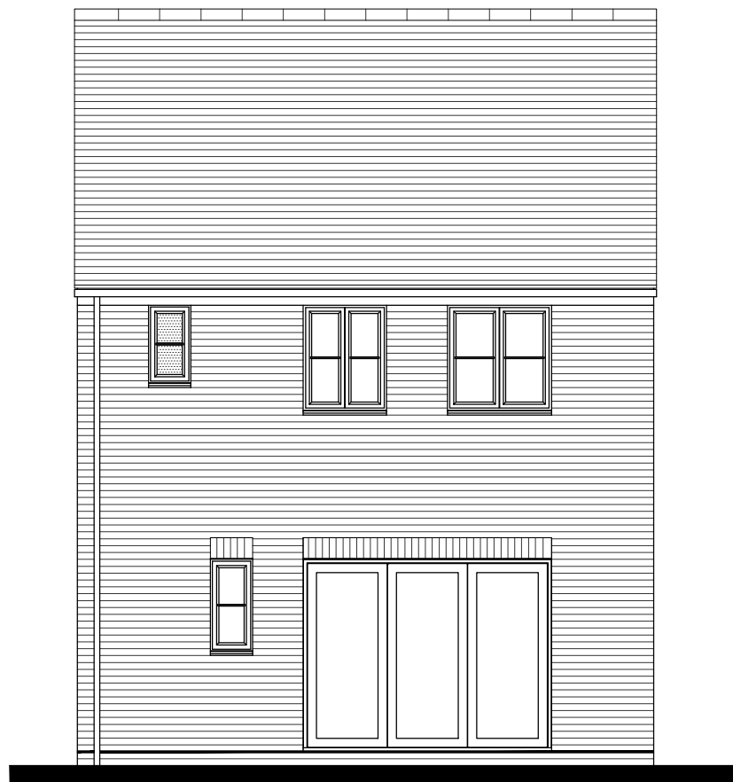
Plot 3 Rear Elevation