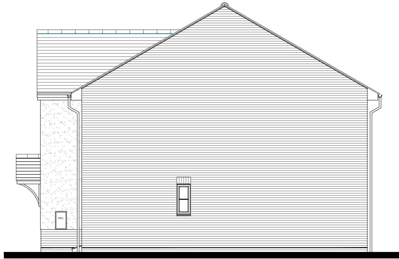
Plot 3 Side Elevation