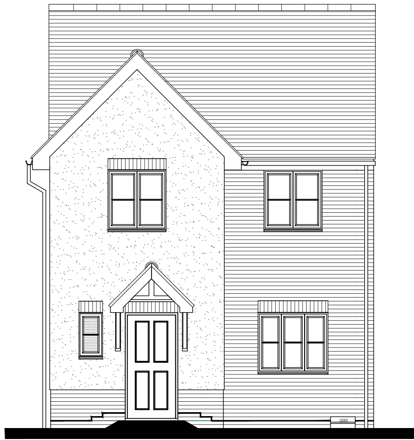
Plot 3 Front Elevation