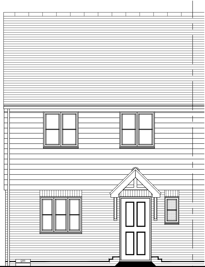
Plot 17 Front Elevation