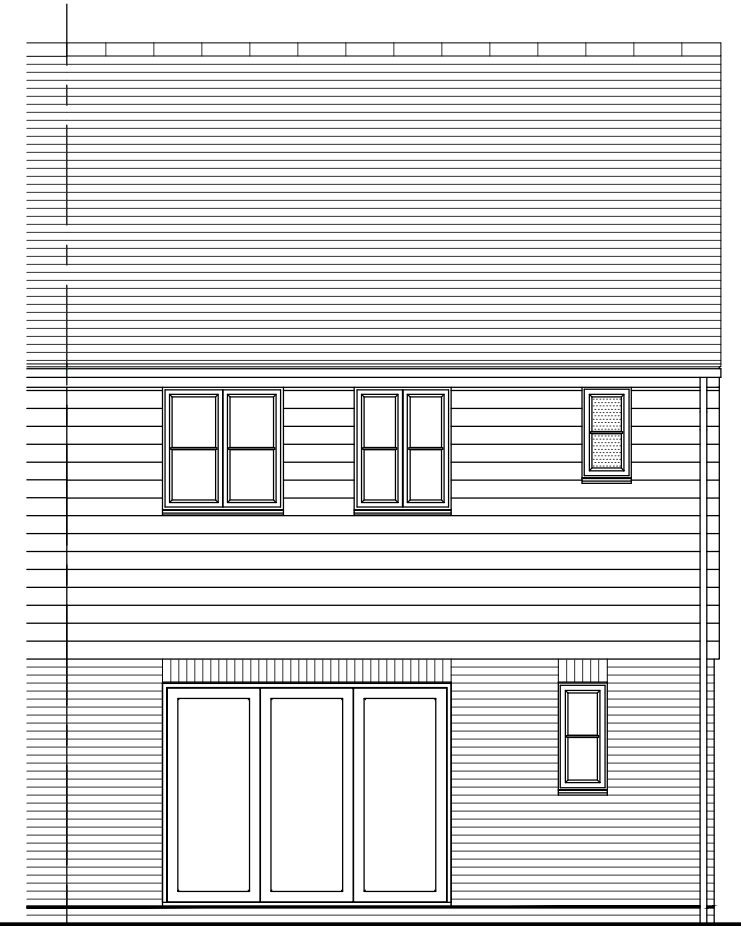
Plot 17 Rear Elevation