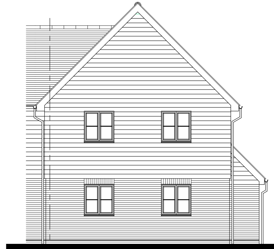
Plot 18 (Ground floor) Side Elevation