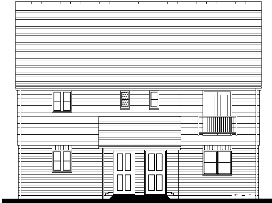
Plot 18 (Ground floor) Front Elevation